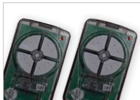
Two TrioCode™128 transmitters