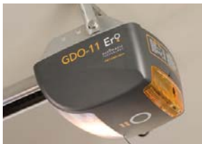
Opener with Courtesy Light